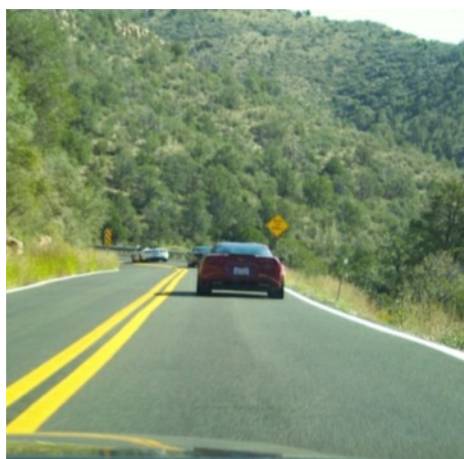
After the show, six cars traveled to Jerome, Arizona, and then onto Sedona, Arizona, for a couple of days.