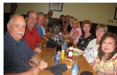
Celebrating our Club's wins at dinner!